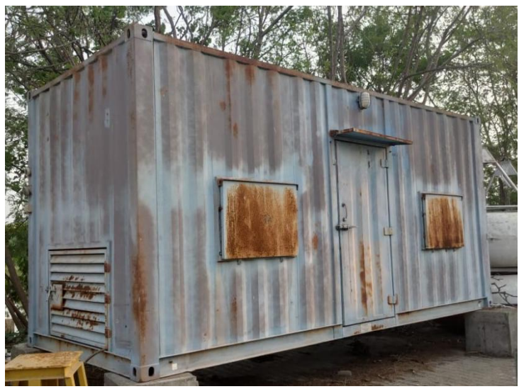
Fig 10: Storage container