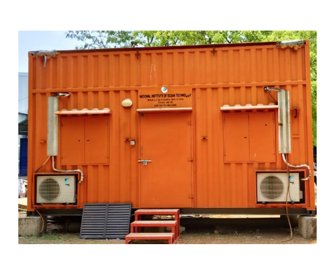
Fig 4. MVVFD container