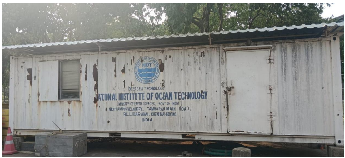
Fig 6: Bunkhouse container

5. Control console- 20ft (L) x 8ft (W) x10ft (H)